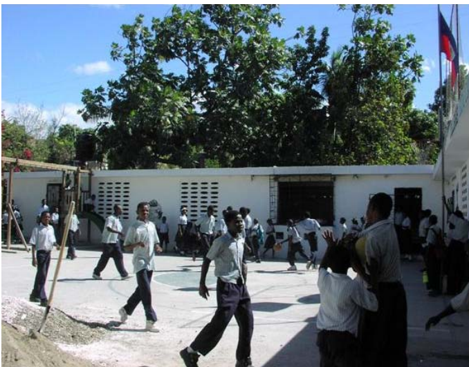
Front view of the existing kitchen/ cafeteria. The proposed kitchen/cafeteria would be built as a second level above the existing kitchen.

An important goal for now and future years is to bring down class size to improve the learning environment for all our students. One way this is being addressed is to add a second floor to the building. We will be moving the cafeteria from the first to the second floor. This will free