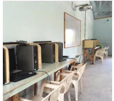
LCM's computer classroom.

The demand for degree-awarding higher education programs in Haiti is consistently strong and substantial. The number of young Haitians completing high school and wanting to pursue higher education keeps on growing on a yearly basis. As a