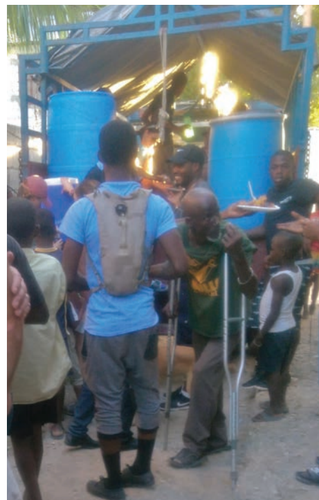
Above: A team distributes hot meals at a homeless shelter during the holidays.